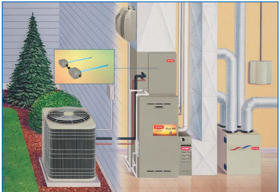
Central Air Conditioner and Gas Furnace System